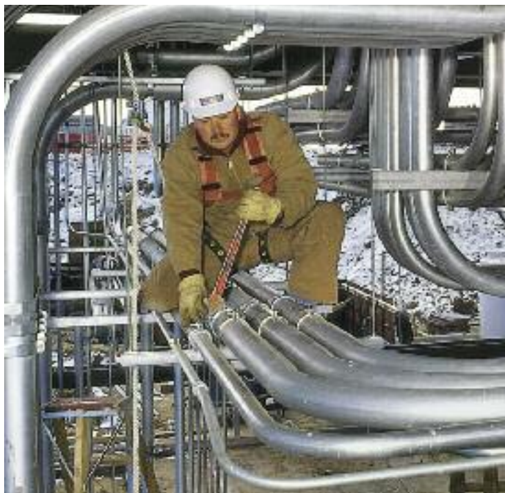
PLAs are project-specific, pre-hire agreements that provide high-quality, on-time construction while creating good, middle-class jobs.

"Project labor agreements make sense for public works projects because they promote a planned approach to labor relations, allow contractors to more accurately predict labor costs and schedule production timetables, reduce the risks of shoddy work and costly disruptions, and encourage greater efficiency and productivity," wrote