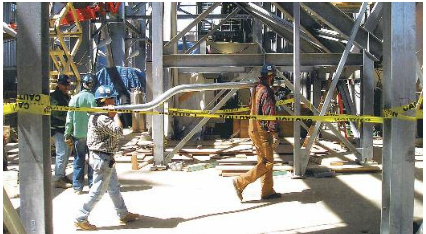
The jobs of thousands of IBEW members are on the line, as anti-union ABC campaigns to outlaw PLAs proliferate across the country.

In the past year, two California municipalities have passed anti-union initiatives that have many construction workers throughout the state worried about their jobs and future.