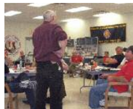
Local 1837 stewards attend advanced training session.