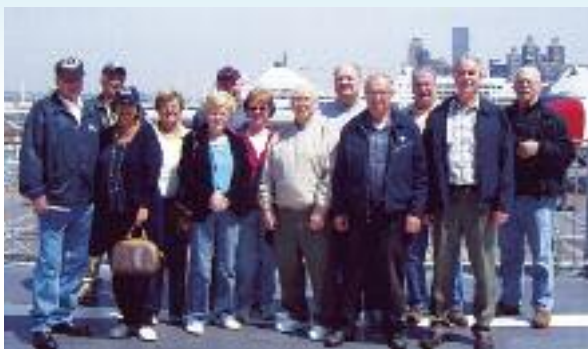
Local 3 Retirees Club, Westchester/Putnam Chapter, members enjoy a visit on the flight deck of U.S. aircraft carrier Intrepid at The Intrepid Sea, Air & Space Museum.