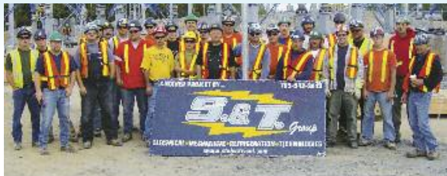
IBEW Locals 1739 and 1687 members display S&T Electric sign at the Nobel transformer job site.