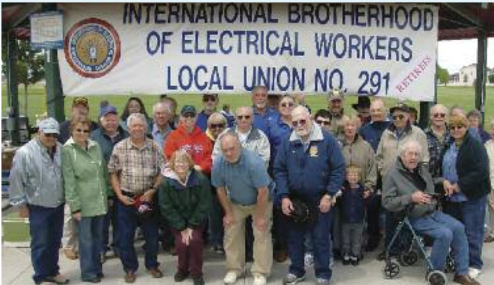
Local 291 Retirees Club members enjoy June lunch/picnic gathering at Settlers Park.