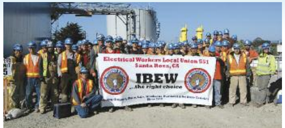
IBEW members gather at the job site of the Local 551 Humboldt Bay Power project.