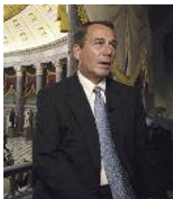
ABC's strongest ally in Congress is House Minority Leader John Boehner.

For more than 60 years, project labor agreements, project-specific, pre-hire collective bargaining agreements, have been a vital tool for contractors and managers—both public and private—to provide cost-efficient, high-quality, on-time construction.