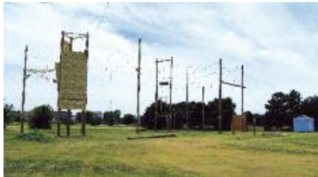
IBEW Local 1523 members who volunteer for Westar Energy Green Team projects helped build a physical fitness obstacle training course at a high school in Clearwater, KS.