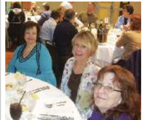
Attendees enjoy a Local 21 Retirees Club dinner at the Robert Morris Culinary College in April.