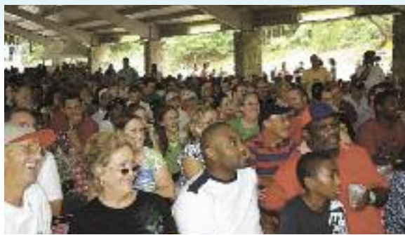
Attendees enjoy the Atlanta Local 613 picnic at Stone Mountain Park.