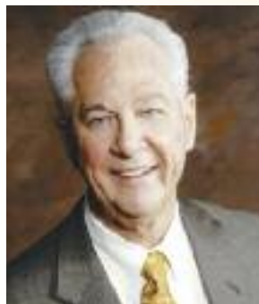
Edwin D. Hill International President

F rustration is growing as policy makers, energy companies and the public struggle for a responsible approach to reducing carbon emissions from coal-fired power plants.