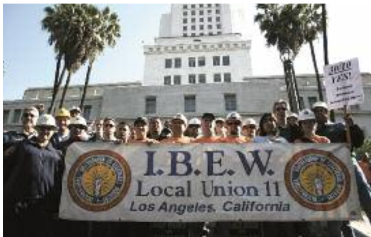
IBEW Los Angeles Local 11 members attend jobs rally.

The 12th Annual IBEW Local 11 Local-Wide Picnic is scheduled for Sat., Oct. 9, from 10 a.m. to 4 p.m.—at the L.A. Police Revolver and Athletic Club, 1880 N. Academy Dr., Los Angeles. There will be games, prizes, food, bingo and fun for the entire